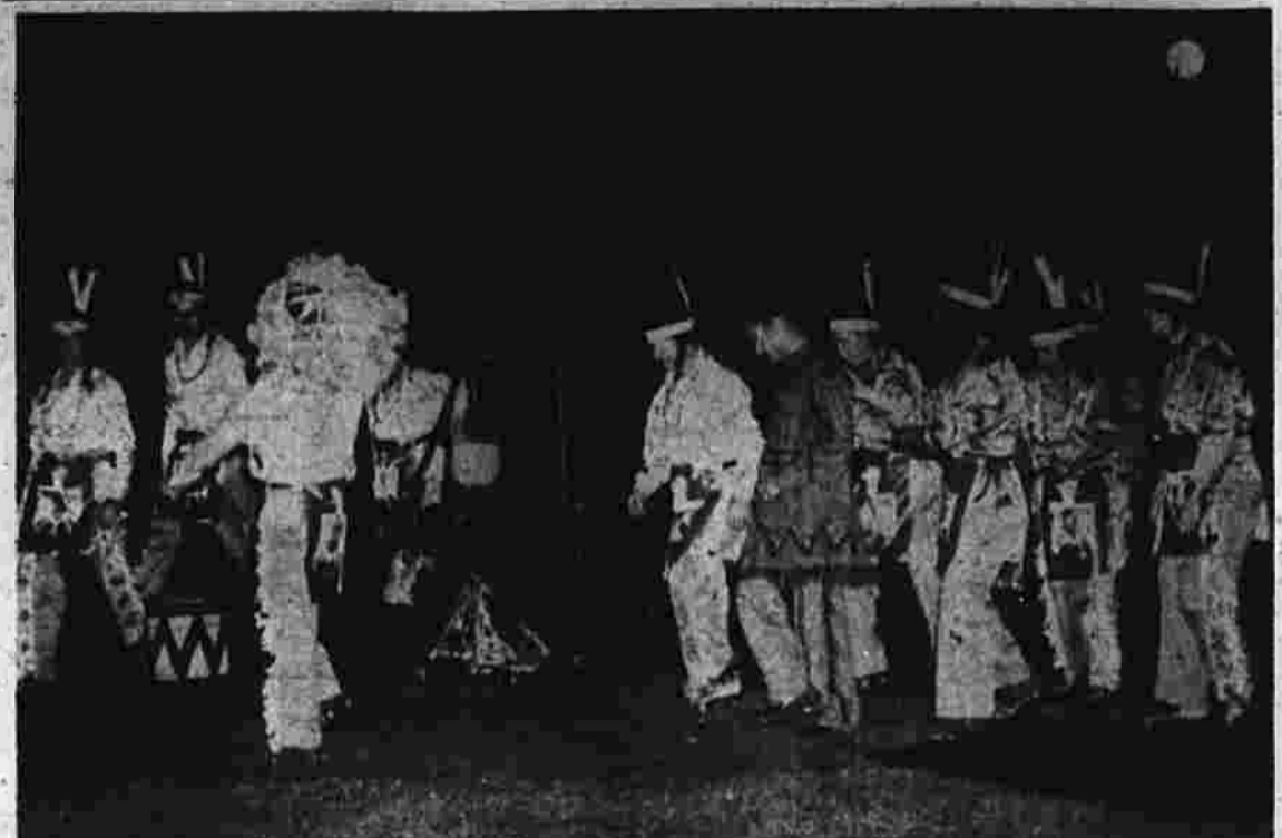
The celebrated Pageant Team of the Haggard Red Men is shown here in one phase of the ceremonial it will present at the State Armory Saturday evening at 8 o'clock, as the opening feature of the United Nations Dance.